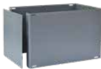
short side open, c-part-sleeve overlaps