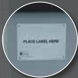
placard label holder