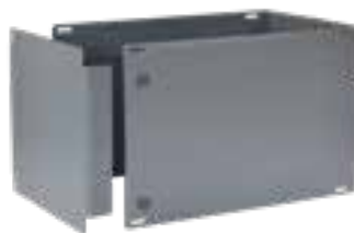
short side open, front panel overlaps