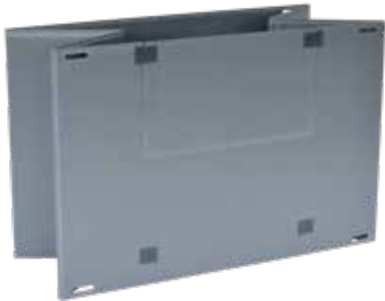
M-fold, hinges on the short side - full collapsible

highest load capacity and individual dimensions