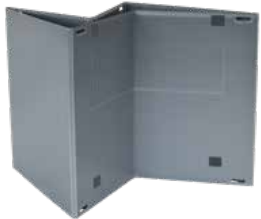
Z-fold, hinges on the long side - full collapsible