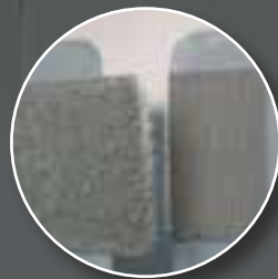
hook- and loop-tape