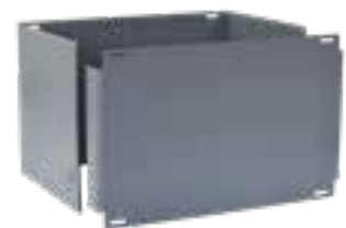
long side open, front panel overlaps