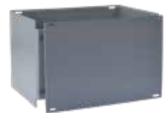
long side open, c-part-sleeve overlaps