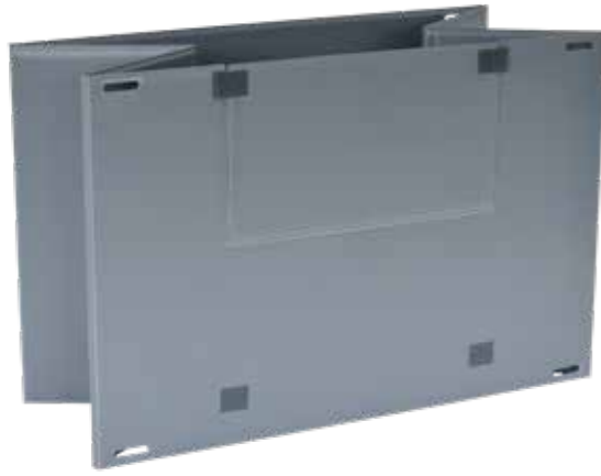
M-fold, hinges on the short side - fully collapsible

highest load capacity and individual dimensions