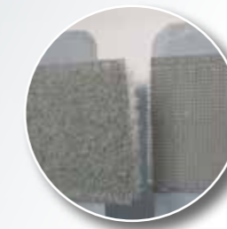
hook- and loop-tapes