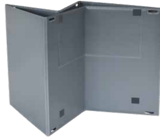
Z-fold, hinges on the long side - fully collapsible