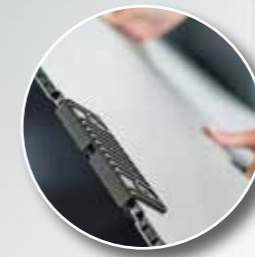
con-pearl® click fix