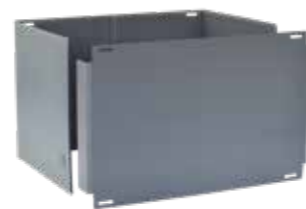
long side open, front panel overlaps