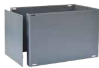
short side open, c-part-sleeve overlaps