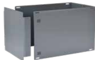
short side open, front panel overlaps