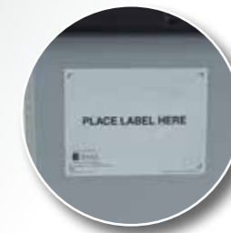
placard label holders