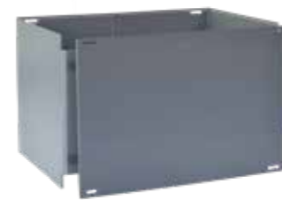
long side open, c-part-sleeve overlaps