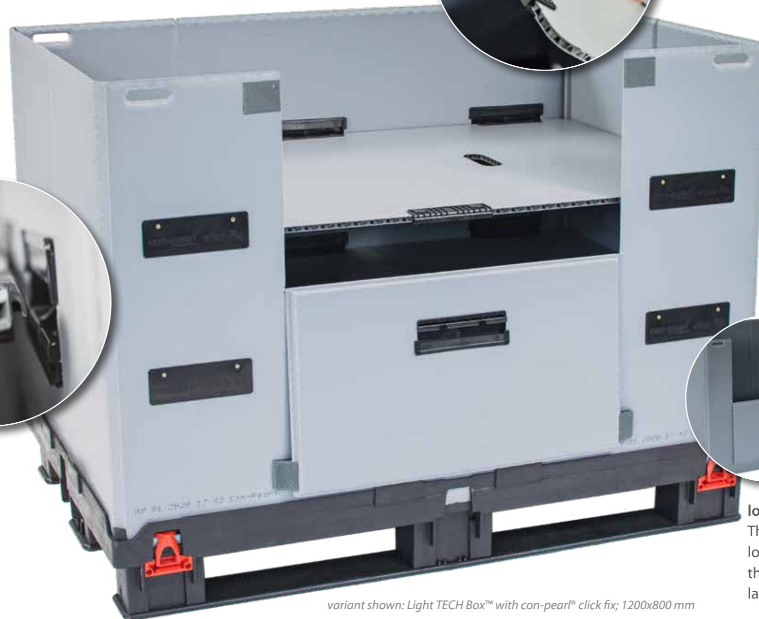
variant shown: Light TECH Box™ with con-pearl® click fix; 1200x800 mm

load door The load door simplifies the loading/unloading of the pallet box and the inserting/removing of intermediate layers.